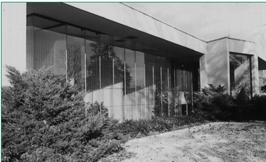
Headquarters of precast concrete producer Trenwa, Inc., Fort Mitchell, Ky., features "Cool Community" concepts such as southwestern-exposed massive concrete wall near glass exterior wall and white aggregate reflecting yard.